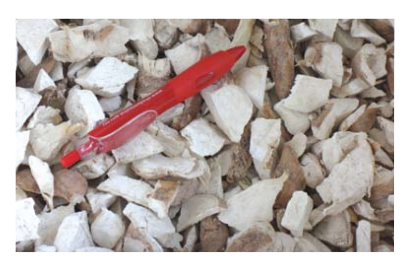
Dried chips, a feedstuff

Traditionally, cassava is used as a food staple by those who cannot afford the more expensive but favoured cereals, such as rice. However, in Malaysia, cassava is eaten as a supplementary food — either steamed, boiled or fried in batter (fritters), or for making bingka , (a traditional Malay cake), tapai (fermented cassava) and