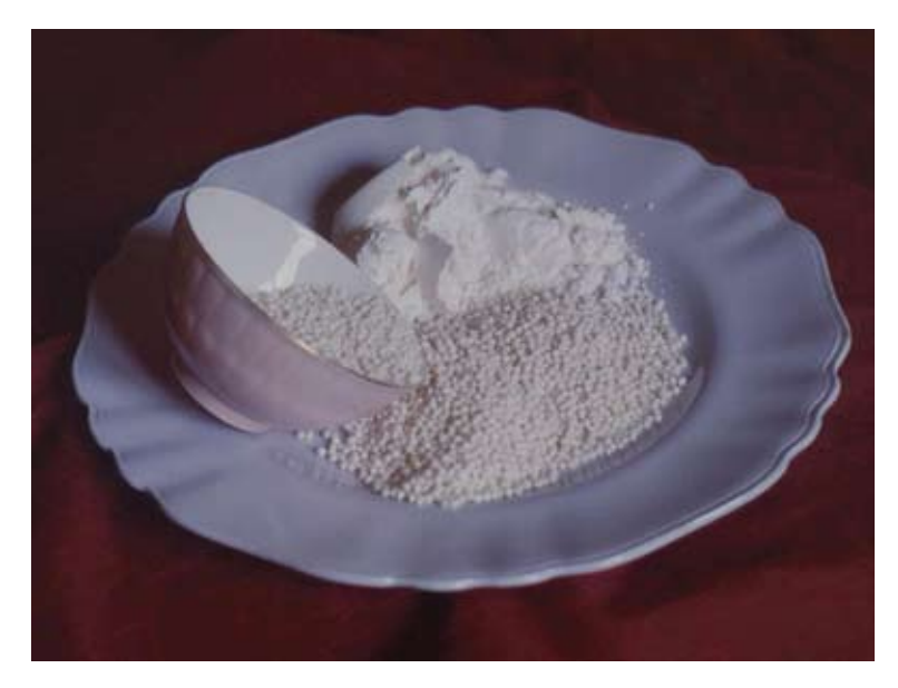
Starch and sago pearls