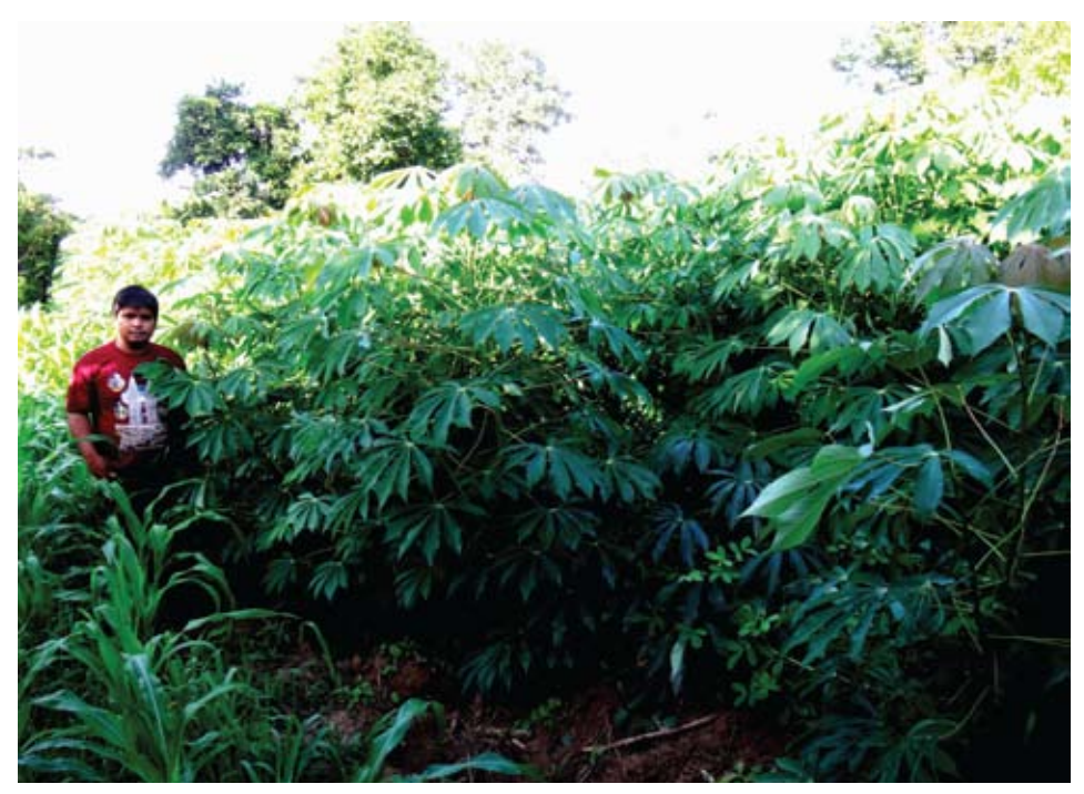
Farmer and young cassava crop

5,709 clones of M. esculenta and 883 genotypes of wild Manihot species. In addition to a field collection, this germplasm is also conserved using in vitro techniques.