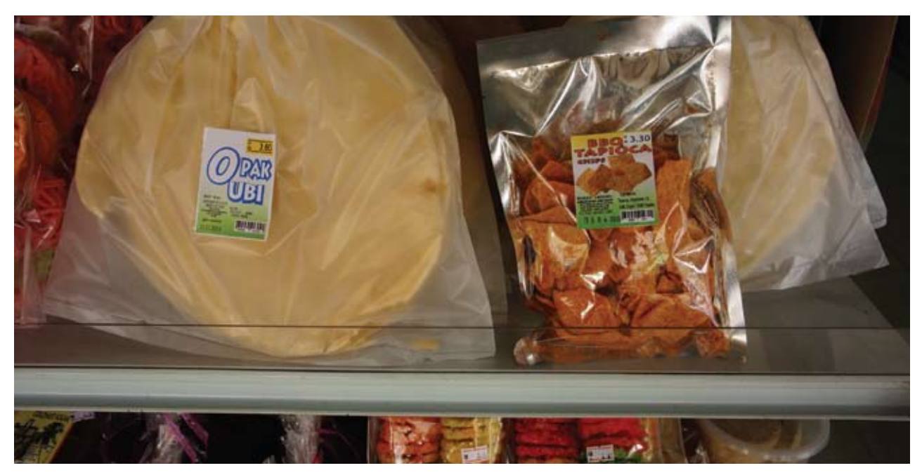
Cassava/tapioca crisps and crackers

The importance of adhering strictly to quarantine regulations when importing planting material of cassava can be appreciated from the unpleasant lesson learnt by Thailand when the pink mealy bug ( Phenacocus manihoti ) was accidentally introduced from Africa. This pest quickly spread and caused yield losses valued at 18,704 million bahts in the two years, 2010–2011. The Thais had to resort to biological control using a parasitic wasp to overcome the problem.