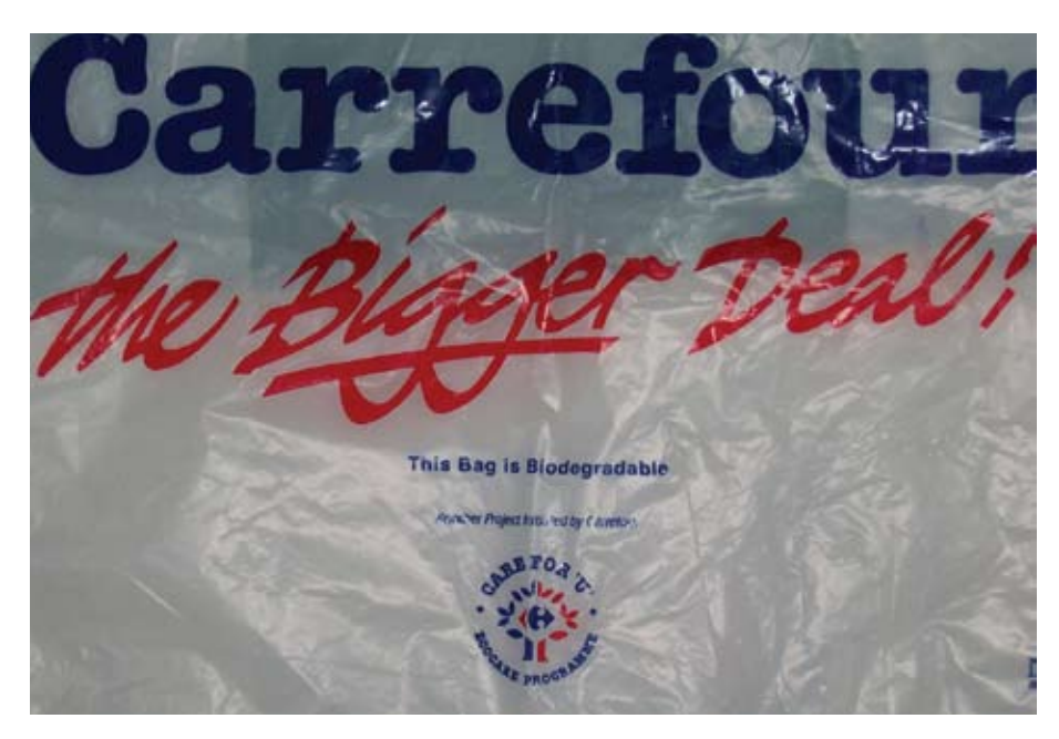
Biodegradable plastic bag