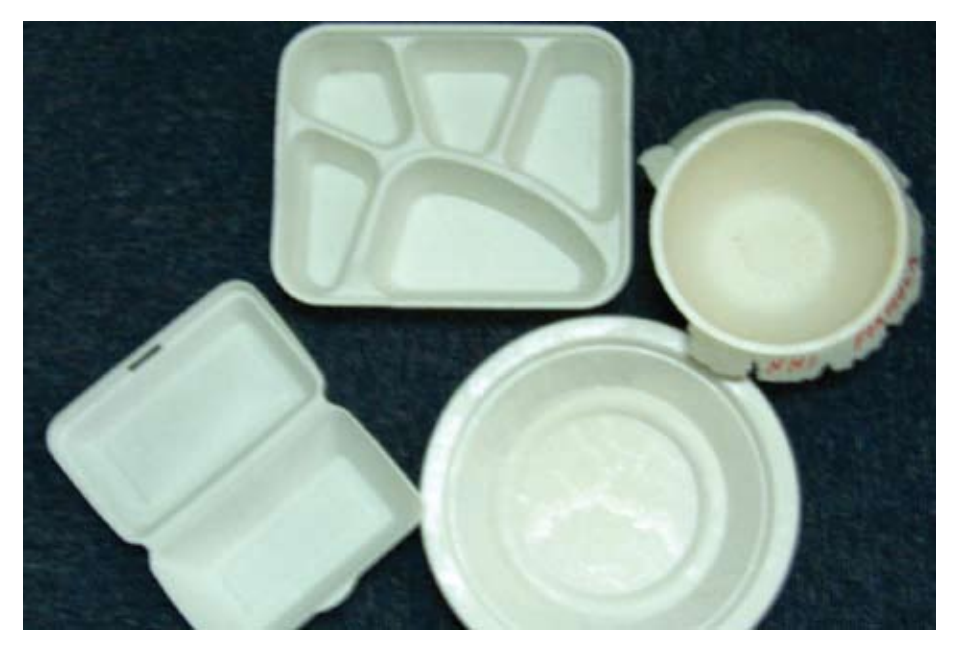
Biodegradable food packaging

"Biodegradable" means being able to be broken down into simpler substances by the activities of living organisms, and so will not persist in the environment. Traditional plastics are not biodegradable because of their long polymer molecules which are too large and too