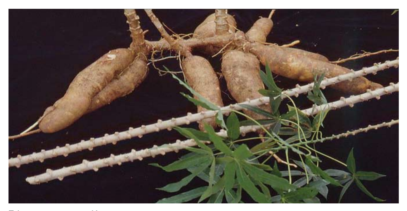
Tuberous roots, stems and leaves

Cassava is an ancient crop of the American tropics. By 1492, when Columbus arrived in the Americas, it had already spread in cultivation all over the American tropics and subtropics. The Portuguese introduced it to Africa but it took a long time to arrive in Asia. It was first recorded in Sri Lanka in 1786. It arrived in India via the Botanic Gardens of Calcutta in 1794. In Asia, it has been regarded as a poor man's food crop, and has long been neglected in research agendas. As an industrial material, it has great potential for commercial production and processing. Much can still be done to develop new applications. The only limiting factor is our imagination!