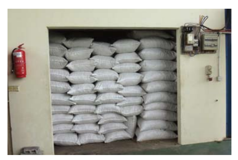
Store full of chips

up to 30% by cassava in non-ruminant feeds, namely pig and poultry rations. Being deficient in certain essential amino acids, the addition of 0.1–0.2% methionine to cassava can push the substitution level further to 50–60%.