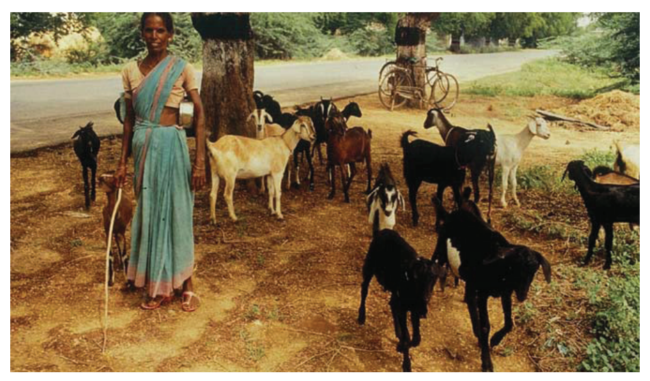
Farmer and her flock of goats in extensive grazing in search of feeds and water in Andhra Pradesh, India. Wayside grazing over 6-10 km is common and includes lopping of tree leaves to meet the feed requirements.

farm income enables diversification of income throughout the year and reduces seasonal risks. Non-farm income as a share of total income averages approximately 32% in Asia, 40% in Latin America, and 42% in Africa (Haggblade et al. , 2005). Policy makers view the non-farm economy as an important contributor to poverty reduction.