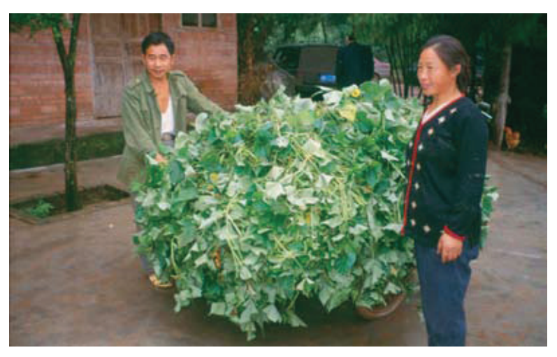
Farmers with harvested virus-free sweet potato vines to feed ruminants and pigs in Sichuan Province, China.

Non-formal education and training are becoming increasingly important, and are conducted at several levels in colleges, universities and government institutions as well as in rural areas at provincial, district, sub-district and farm levels. The rationale and justification for such efforts are determined by prevailing circumstances and urgent or particular needs and constraints.