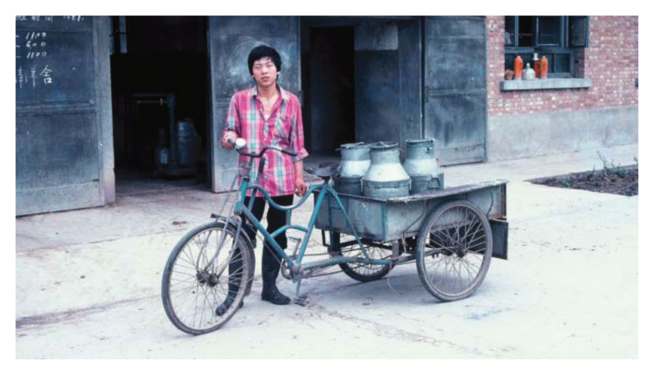
Marketing and delivery of milk at the village level in Xian Province, China.

and peace." The International Food Policy Research Institute IPFRI (2015) has just completed a policy seminar that examines how gender research and its application to policy issues have changed the landscape of food policy and agricultural development programming. Among the key observations are these two: