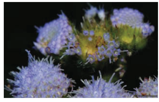
Figure 1. Capitula showing open florets, young fruits, and floret buds of Ageratum houstonianum. Scale bar: 2 mm.

Leaf blade with base cordate to truncate (Fig. 2A). Involucral bract narrowly lanceolate, conspicuously pilose (Fig. 2B). Capitulum with 75–100 florets ..... A. houstonianum