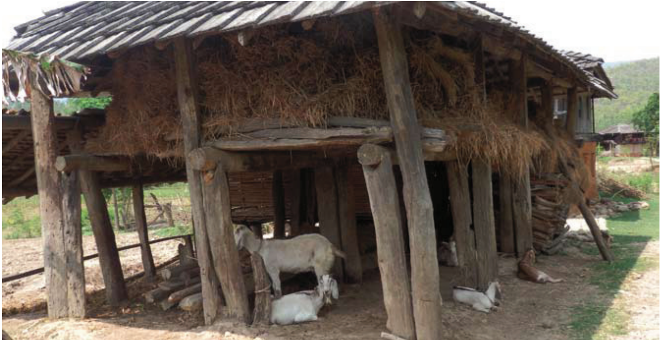
Typical small farmer household in Chulidanda hilly area, Nepal. Note how part of the house is used to store cereal straws for winter feeding, and to serve as a pen to house the goats.