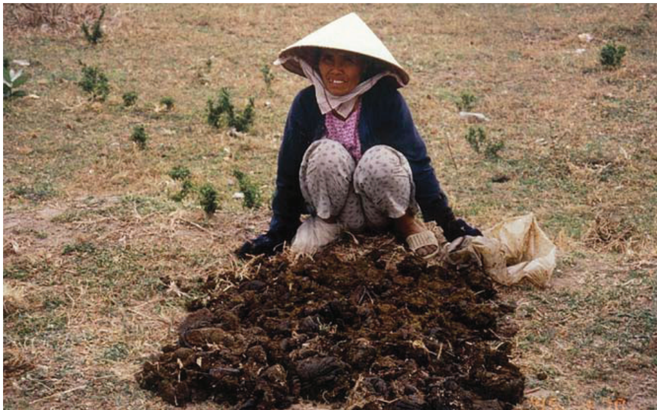
Cow manure to fertilize and prepare the soil for rice cultivation in Bin Phouc Province in Vietnam.