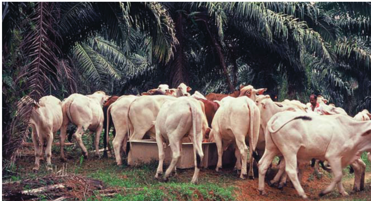
The integration of Brahman cattle with oil palm plantations in Kinabalu, Sabah, Malaysia.

R ainfed agriculture is agriculture that is totally dependent on rain. In the absence of irrigation, rainfed lands, especially those in the arid and semiarid agro-ecological zones of the world, have been regarded as fragile, marginal, waste, problematical, threatened, low potential or less-favoured lands. The term ‘ less favoured areas ’ (LFAs) is better as it is relatively free of negative connotations.