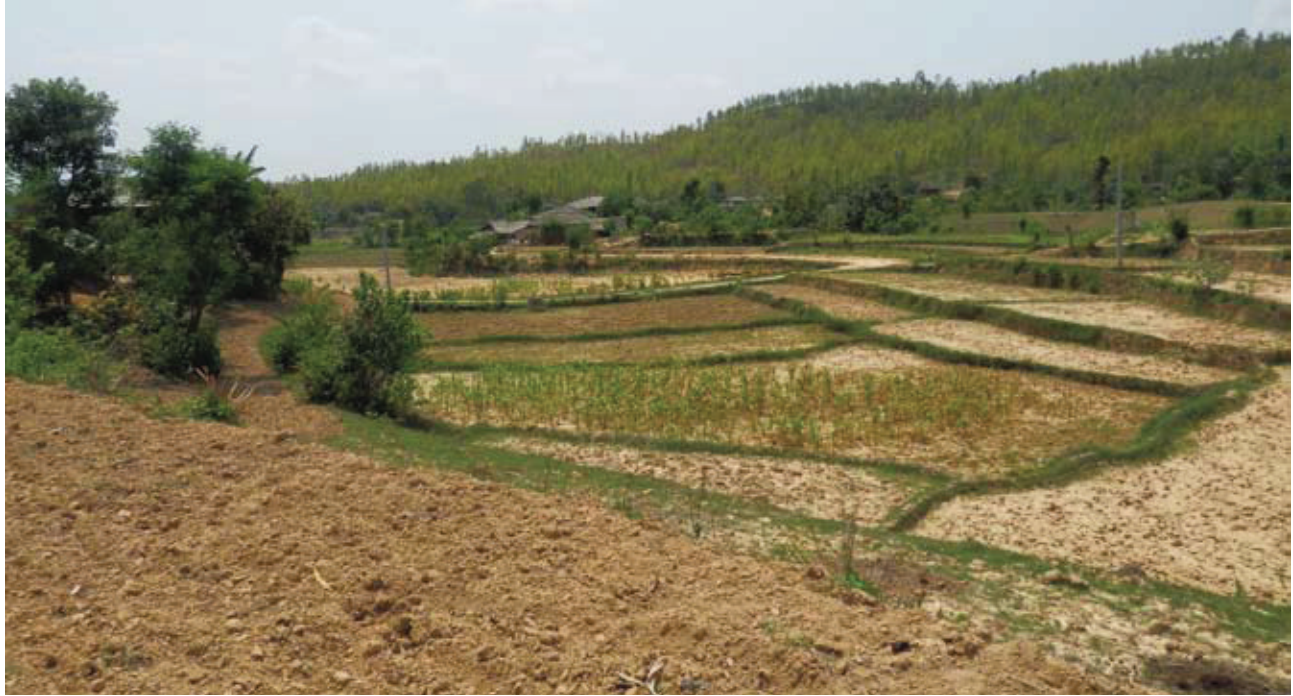
Typical lowland and upland continuum in Chulidanda hilly area in Nepal.

Increasing food production in the future is linked to three possible pathways: