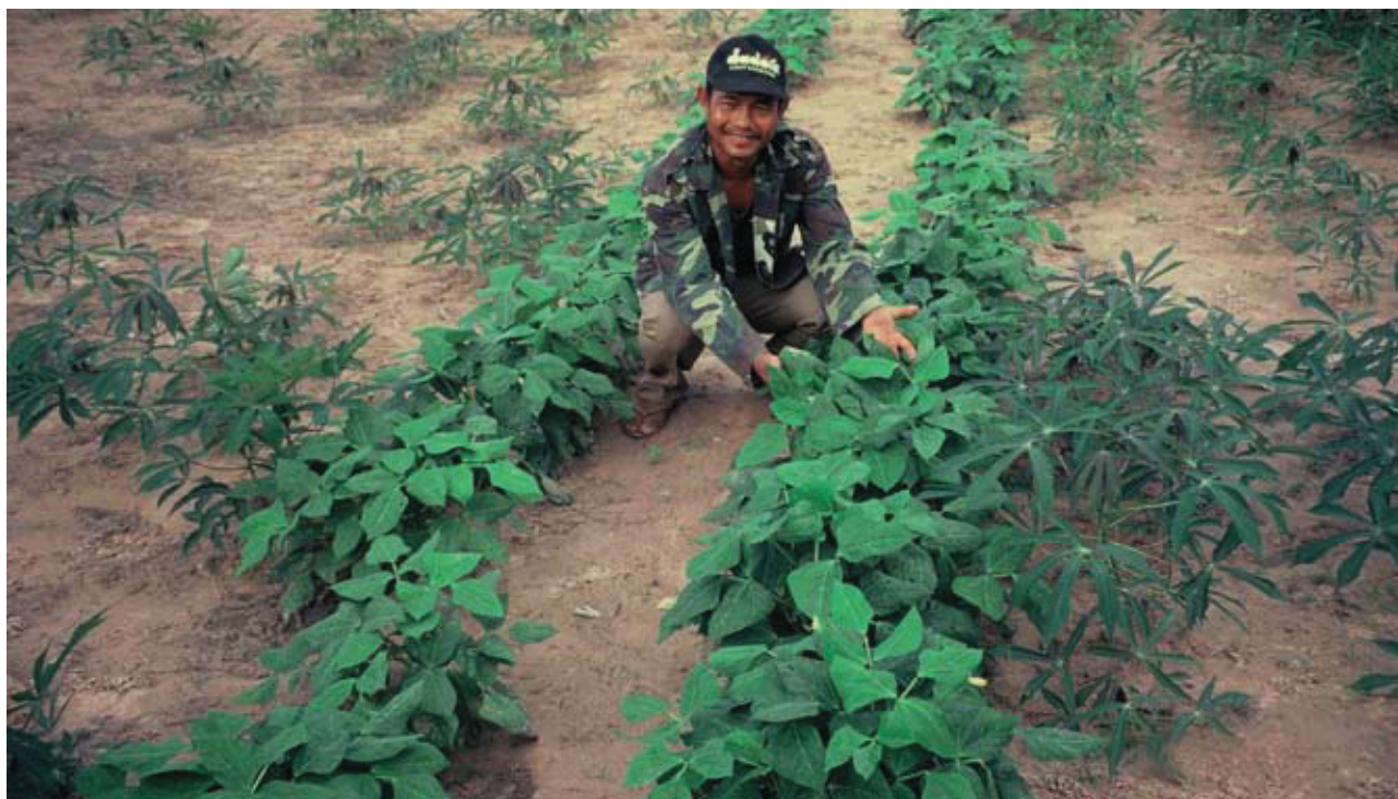
The food-feed system is an important strategy. Photo shows farmer with cowpea- cassava system to benefit both household consumption and feed for animals in Mahasarakam, North East Thailand, similar to rice-siratro-mungbean cropping system in the Philippines.

Emphasis should be given to such areas because they should be able to support relatively high crop yields.