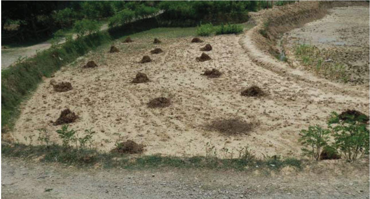
Dung from ruminants is the main source of fertiliser in small farms. Photo shows small amounts of dung dispersed in rainfed areas of Chulidanda, Nepal, awaiting ploughing using cattle to cultivate the rice field.

especially in the semi-arid and arid agro-ecological zones will come under great pressure and are likely to be associated with the following problems: