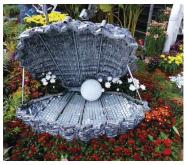
A giant clam by Limkokwing University of Creative Technology.

A total of 1,200 people comprising of school students, undergraduates, teachers and lecturers from 19 primary, 19 secondary schools and 15