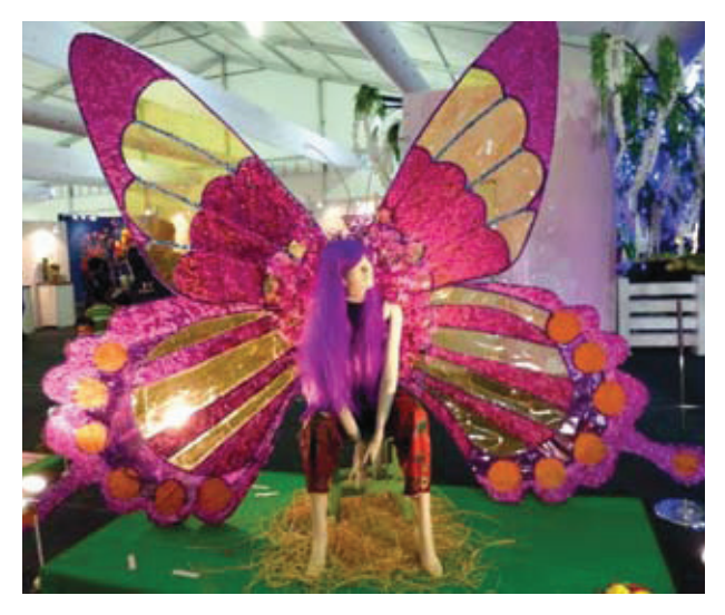
Floral butterfly by Tan Bee Lee