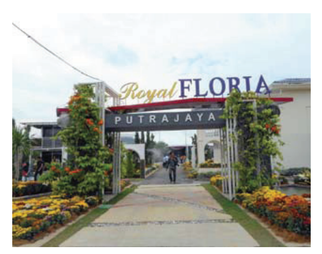
Royal Floria Putrajaya entrance

The theme flower this year was CHRYSANTHEMUM. Chrysanthemums are popular as festival flowers especially for Chinese New Year, Wesak Day, Deepavali, Thaipusam, Qing Ming and All Souls Day. Chrysanthemums have been cultivated in China for 2,500 years and have inspired many renowned Chinese poems and paintings. In Japan, chrysanthemums are known as "kiku-no-hana". Japan's imperial emblem is a 16-petalled chrysanthemum flower. Chrysanthemum or "mum" in short, is native to East Asia.