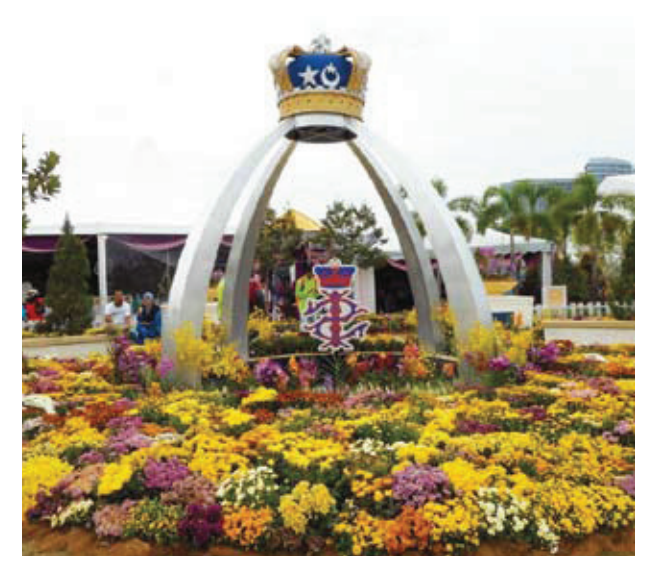
The Johor Royal Garden display.

Today, the thousands of hybrids and cultivars are classified according to different bloom forms such as irregular, irregular, intermediate, incurved,