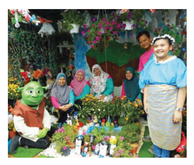
Display by SK Convert (M) Kajang primary school