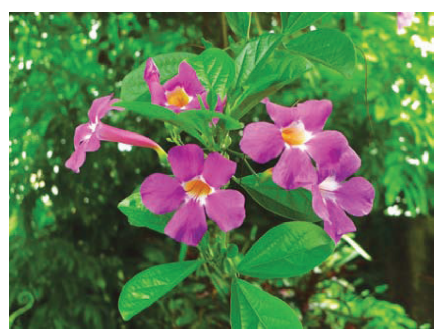
Saritaea magnifica (Glow Vine)

This is a vigorous woody tendril-climber, native tropical America, that requires a strong support. The large purple flowers are borne above the foliage so the supporting structure should be a low wall or trellis for the flowers to be appreciated easily.