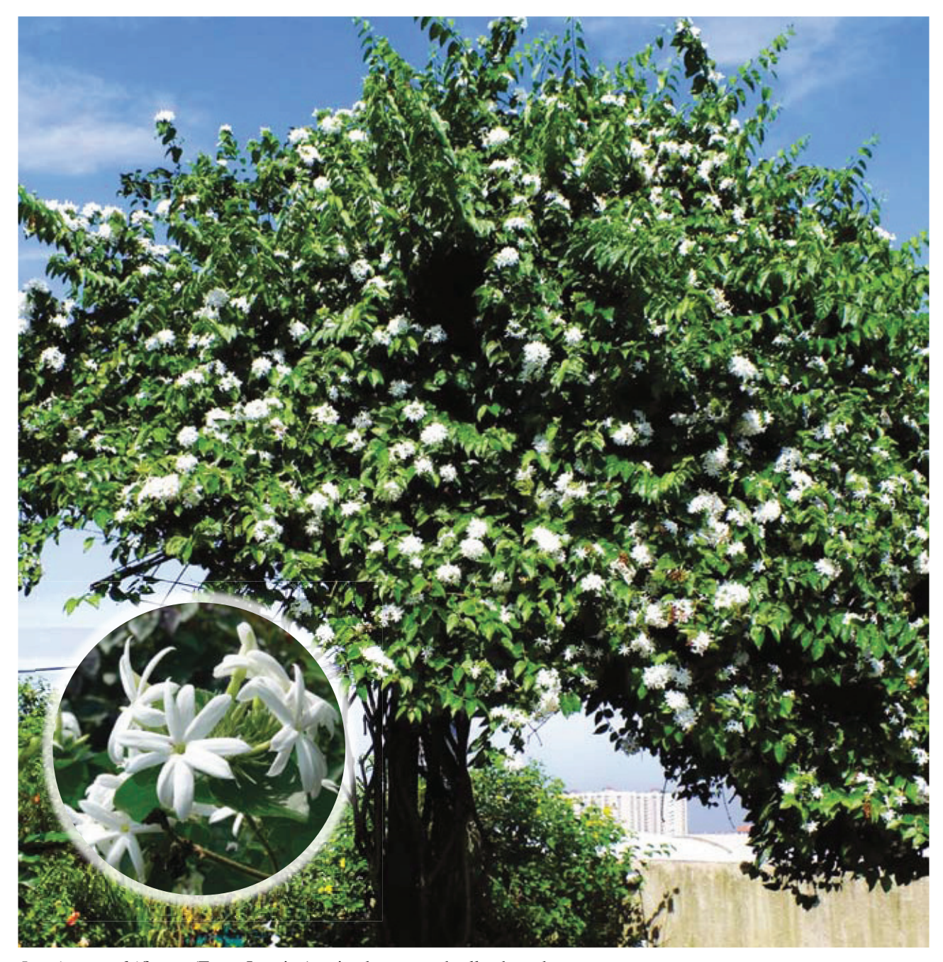
Jasminum multiflorum (Furry Jasmine) trained on an umbrella-shaped support

location is good enough because when the plant is in full bloom in the morning, it calls attention to itself no matter where it is grown.