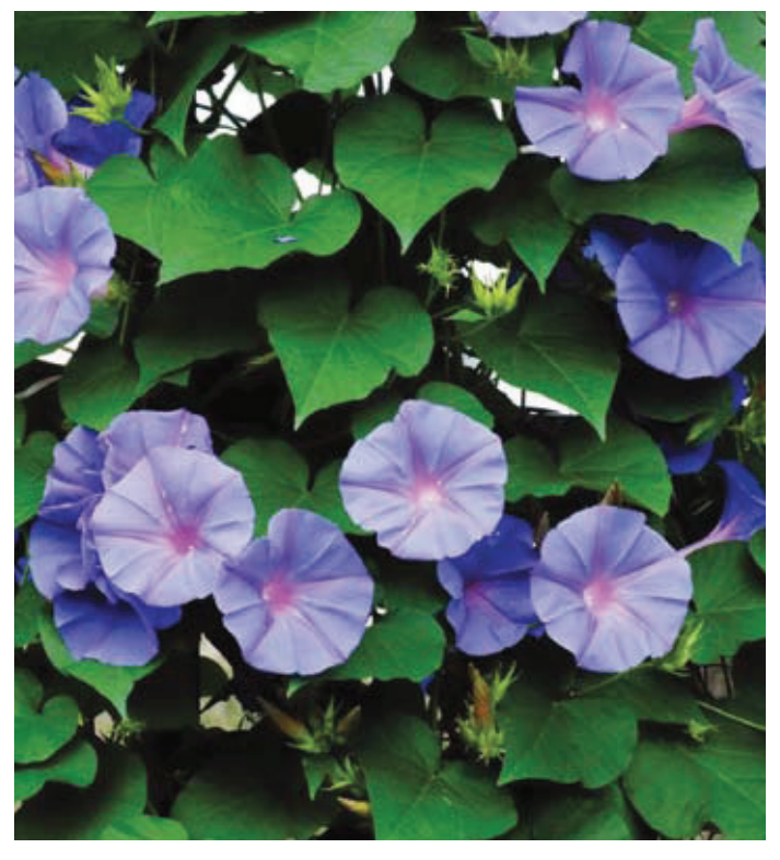
Ipomoea indica (Indian Morning Glory)