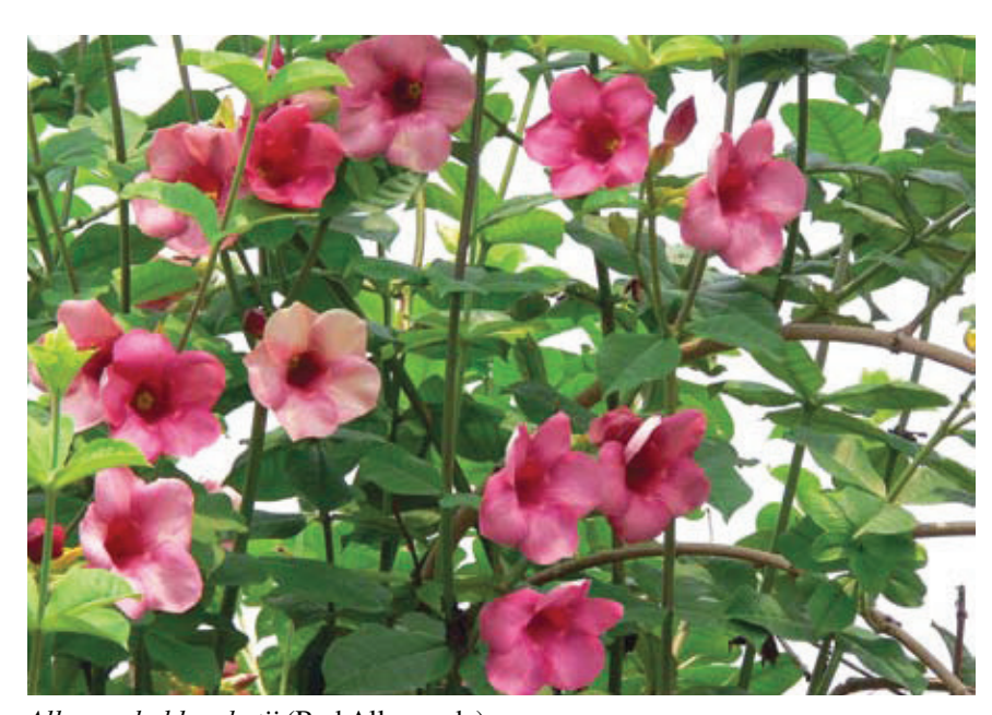
Allamanda blanchetii (Red Allamanda)

Native to Brazil, this semi-woody twining climber can be tied to the central post of an umbrella-like support and allowed to spread out over the top to make an attractive tree-like structure bearing large purplish-red flowers near the branch tips. The related yellow-flowered Allamanda cathartica (Yellow Allamanda) is more vigorous and more branchy, requiring more frequent pruning to keep in shape.