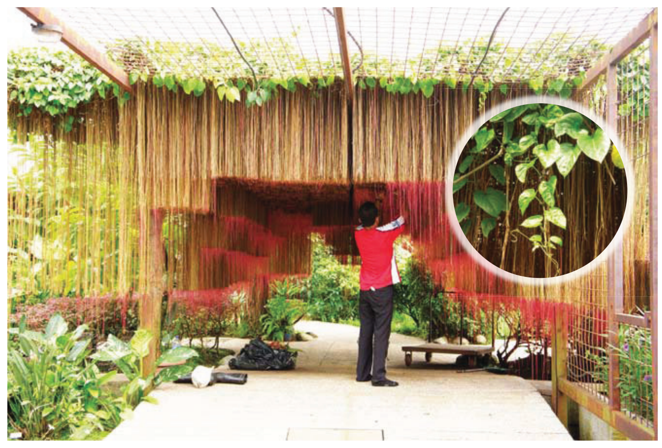
Cissus nodosa (Stringy Cissus; Thousand Roots) being trimmed