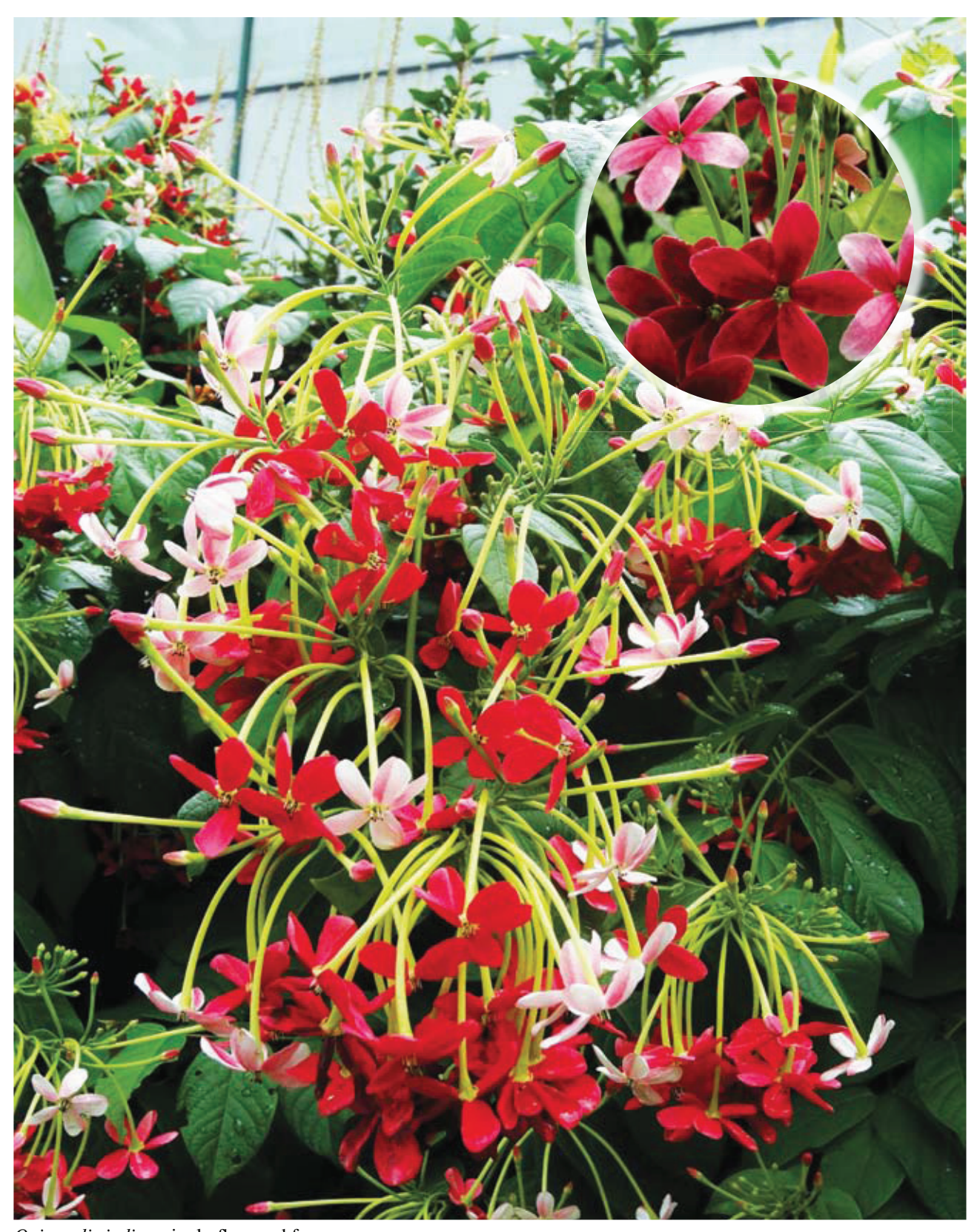
Quisqualis indica, single-flowered form