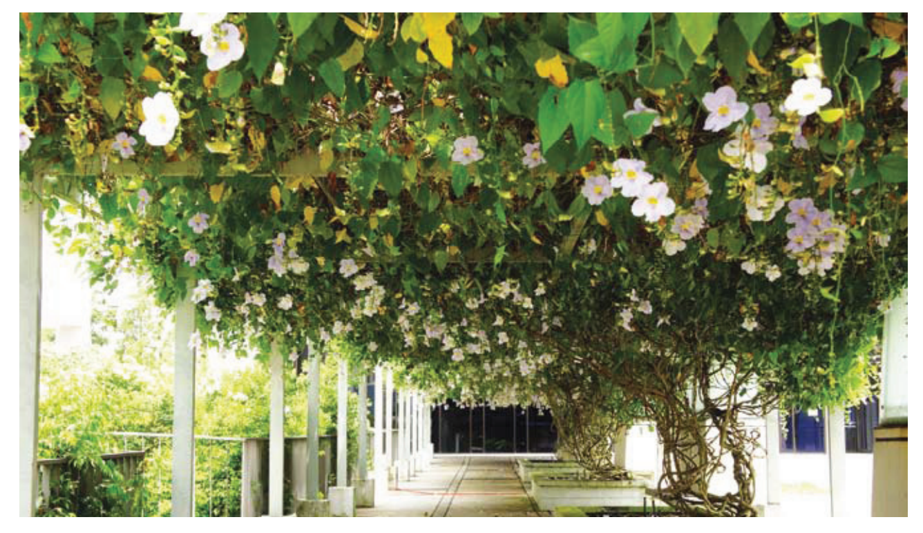
Thunbergia laurifolia (Purple Clock Vine) on a 137 ft long pergola