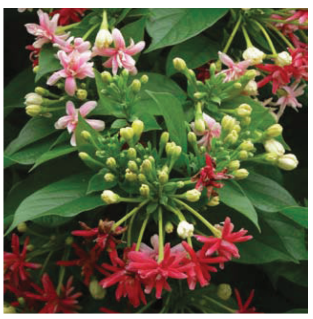
Quisqualis indica (Drunken Sailor, Rangoon Creeper) double-flowered form

East India Company in the 1600s. According to one account, the plant had an Indonesian name udani that sounded to Rumphius like the Dutch hoedanig meaning "what sort" or "what is it". This gave Rumphius the idea of calling it Quisqualis .