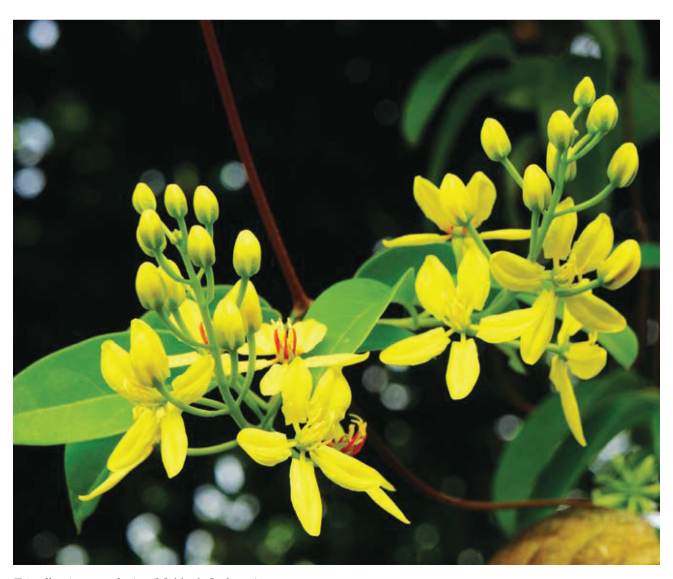
Tristellateia australasiae (Maiden's Jealousy)

A tropical Asian plant, the maiden's jealousy is a slender semi-woody twining climber that bears masses of golden yellow flowers. Each flower lasts three days. The origin of the common name is unknown.