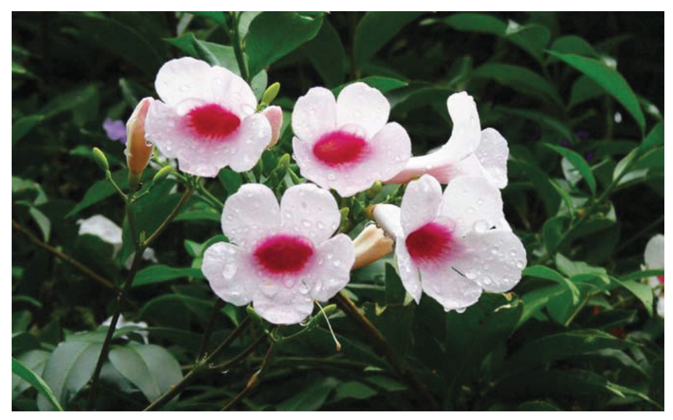
Pandorea jasminiodes (Bower Vine)