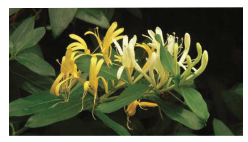
Lonicera japonica (Japanese Honeysuckle)

A short-lived slender tendril-climber grown for its ornamental fruits which can be used as water containers. This is the only plant known to have been present in the Americas as well as in Africa and Asia before the voyage of Columbus. There are varietal differences in the size and shape of the gourds. Mini gourds two to three inches long are less showy on a pergola than medium sized gourds. The life span of the plant is usually less than one year so for a perpetual display, new plants have to be started from seeds before the old plants decline.