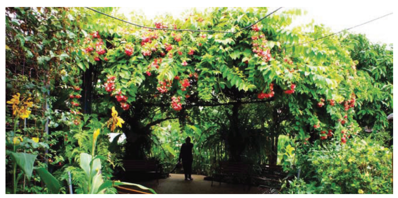
Quisqualis indica on a big circular pergola used for outdoor functions of up to 40 participants.