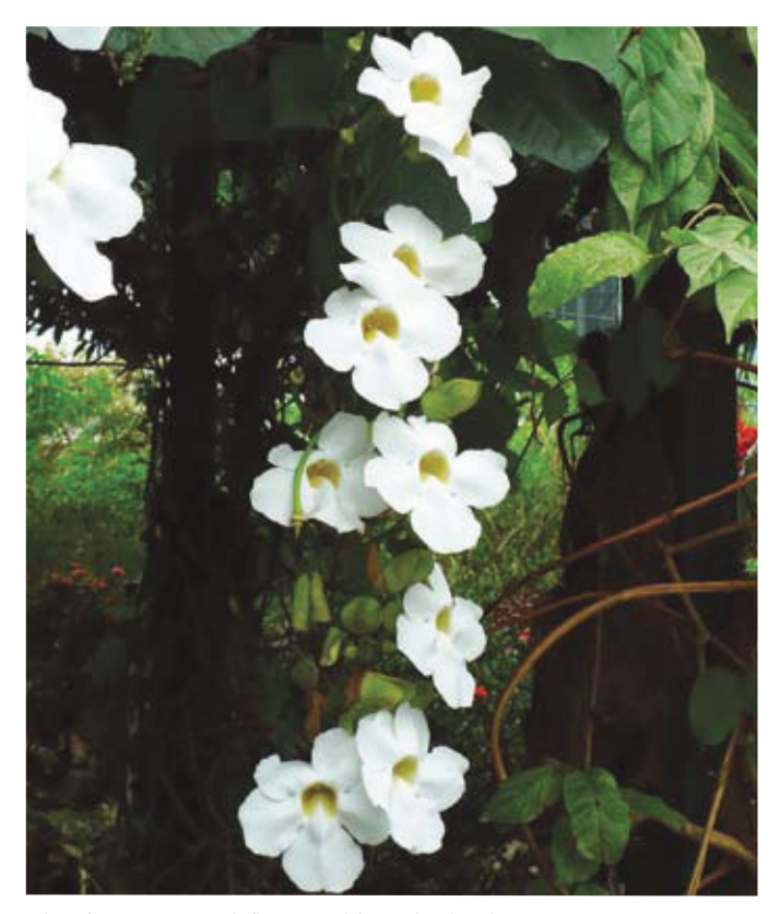
Thunbergia grandiflora (White Clock Vine)

The clock vines are vigorous woody twining climbers, native of Burma and India. In Malaysia, T. laurifolia has leaves longer than broad, and purple flowers on pendulous inflorescences 1–2 ft long while T. grandiflora has broadly heart-shaped leaves and white flowers on longer pendulous inflorescences 3–5 ft long. After flowering the leafy shoots bearing the spent inflorescences should be cut back to encourage new growth. The cutting back of the shoots should be spread out evenly through time so that new shoots and inflorescences are produced continuously.