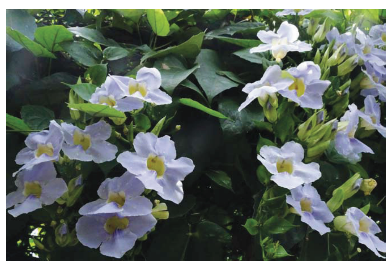
Thunbergia laurifolia (Purple Clock Vine)

A garden in the humid tropics is, by default, a garden of leaves. Leaves have two vital functions. One is to photosynthesise and make food for the plant. The other is to enable a plant to occupy and defend its space against other plants. In the tropics and particularly in the humid tropics where the climate allows for continuous growth and competition, the production of leaves for occupation and defence of space takes precedence over the