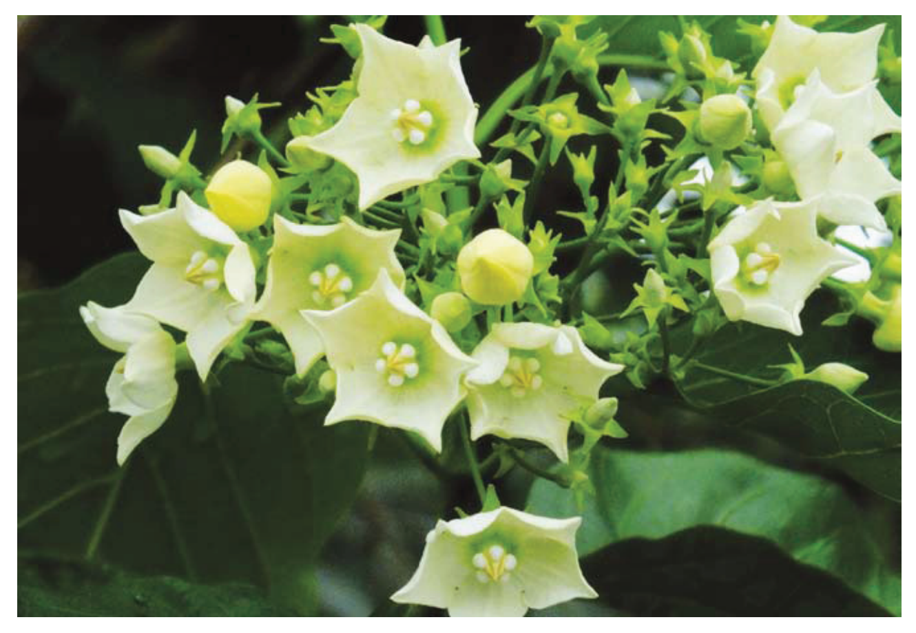
Vallaris glabra (Kesidang, Kerak Nasi)