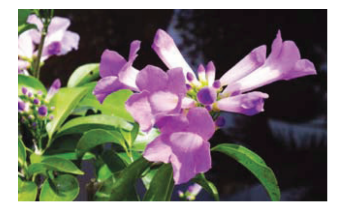
Mansoa alliacea (Garlic Vine)