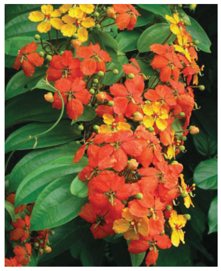
Bauhinia kockiana (Peacock Bauhinia)

One of the most spectacular of the freeflowering climbing varieties, known by the cultivar name of 'Formosa', was first named and exhibited in London in 1904 (Menninger 1970). The light purple flowers of 'Formosa' form at the tips of the growing stems and as they age the flowers become dry and papery but do not fall off until the flower stalks wither away. As the stems continue to elongate and add on new flowers, the plant gets covered with spectacular cascading floral sprays over six feet long. 'Formosa' was common in the colonial gardens of British Malaya but is uncommon now. It may have been responsible for the Malay name bunga kertas (paper flower) for all bougainvilleas. I have seen 'Formosa' in some other countries and they are very striking in gardens on the Adriatic coast of Croatia.