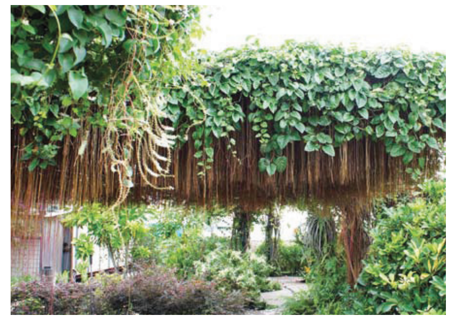
Cissus nodosa untrimmed

This slender vigorous tendrilclimbing plant is native Indonesia. It flowers continuously but the flowers are small and inconspicuous. The plants are grown for their long dangling air roots that are dense enough to be trimmed into decorative designs. The roots grow so quickly that they have to have a 'haircut' twice a week. They look untidy if left untrimmed.