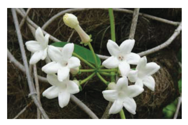
Marsdenia floribunda (Stephanotis)

A slender semi-woody tendril-climber, native to tropical America, with leaves and flowers smelling of garlic when crushed. Until about 20 years ago, the plants flowered irregularly at unpredictable intervals following some unknown climatic stimulus that would simultaneously trigger flowering over a wide area. The new varieties flower almost continuously.