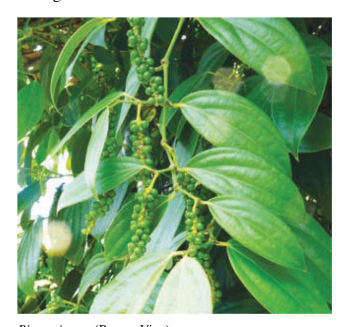
Piper nigrum (Pepper Vine)

A native of tropical America, this is a slender twining climber with yellow flowers, resembling Allamanda cathartica but is more elegant and manageable.